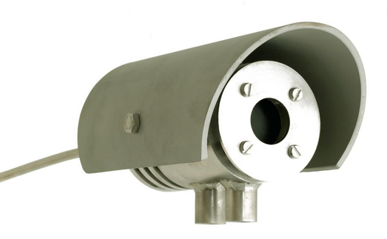
Figure 1 HF02 flare radiation monitor / heat flux sensor

HF02 is a sensor that measures radiant heat flux or thermal radiation in the outdoor environment. A common application is monitoring the radiation emitted by flares. HF02 is certified for use in potentially explosive atmospheres, and is rated for radiation levels up to 15 \times 10^3 \text{ W/m}^2 . We recommend use of HF02 in a decision-supporting role only, and not to use measurements of HF02 as the main or sole source of information for judging safety.