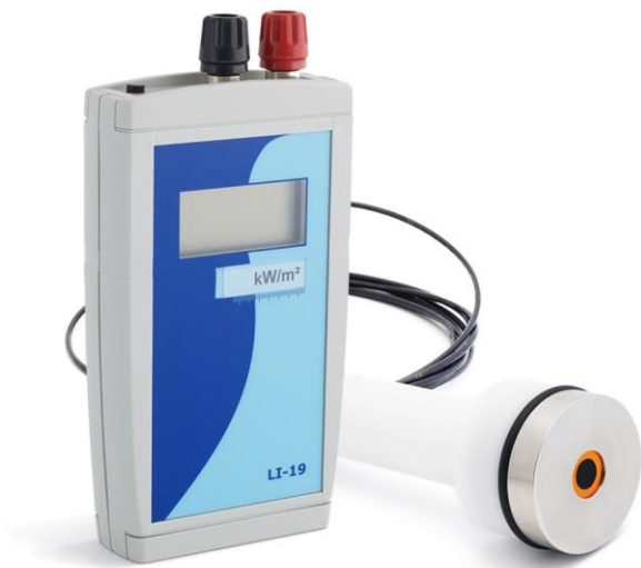
Figure 1 HF03-LI19 portable heat flux sensor with read-out unit / datalogger

HF03 is a heat flux sensor that is applied in mobile measurements. It is combined with LI19, a high accuracy handheld read-out unit / datalogger. The combination HF03- LI19 is typically used to study heat flux levels of flares and fires, and to verify the performance of permanently installed flare radiation monitors and flare heat flux sensors.