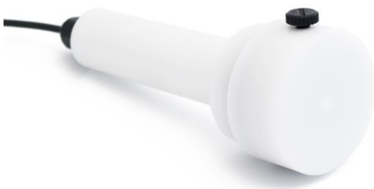
Figure 4 HF03 with its protection cap