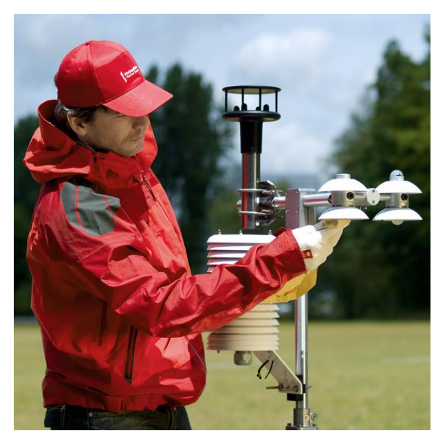
Figure 2 STP01 is often used in meteorological surface energy flux measurement stations