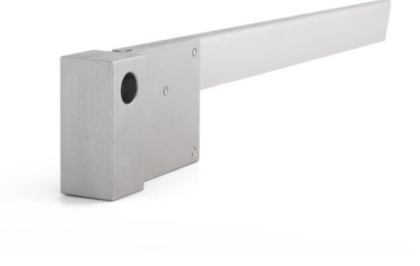
Figure 3 IT01 insertion tool is hammered down into the soil. After retracting it leaves a slit in which STP01 may be inserted

For ease of installation with a minimum of disturbance of the local soil, Hukseflux offers IT01 insertion tool.