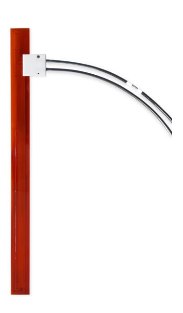
Figure 1 STP01 soil temperature profile sensor is applied in many large scale networks .

STP01 accurately measures the temperature profile of the soil at 5 depths close to its surface. It is used for scientific grade surface energy balance measurements. The sensor is buried and usually cannot be taken to the laboratory for calibration. The on-line self-test using the incorporated heating wire offers a solution to verify STP01's measurement stability.