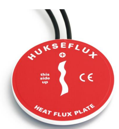
Figure 4 STP01 is often used in combination with HFP01SC self-calibrating heat flux sensor, shown in the picture